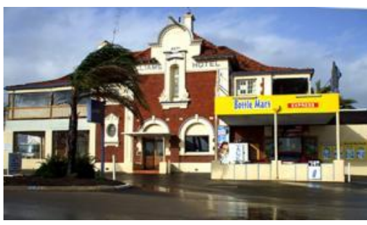
Williams Hotel, Albany Highway, Williams (Battye, J.S., Cyclopedia of Western Australia , Vol.2, 1913, p.711; http://publocation.com.au/pubs/wa/williams/williams-hotel 10 Nov 2011)