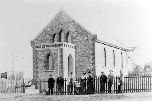
Cuballing Hall (HCWA Pic2103); Baptist Church, Fortune Street, Narrogin (SLWA 012618D)