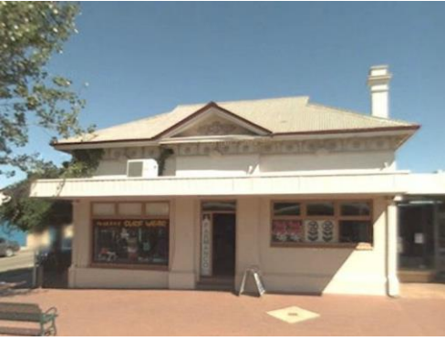
Cornwall Hotel, Doney St, Narrogin; Cornwall's Buildings, Egerton St, Narrogin