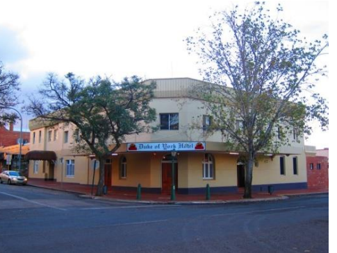
Duke of York Hotel, 61 Federal Street, Narrogin (Battye, J.S., Cyclopedia of Western Australia , Vol.2, 1913, p.712; Google 2011)